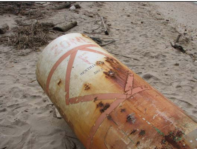
Photo3: Show close up of markings& condition.